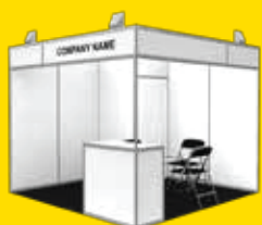
Exhibit Space Cost